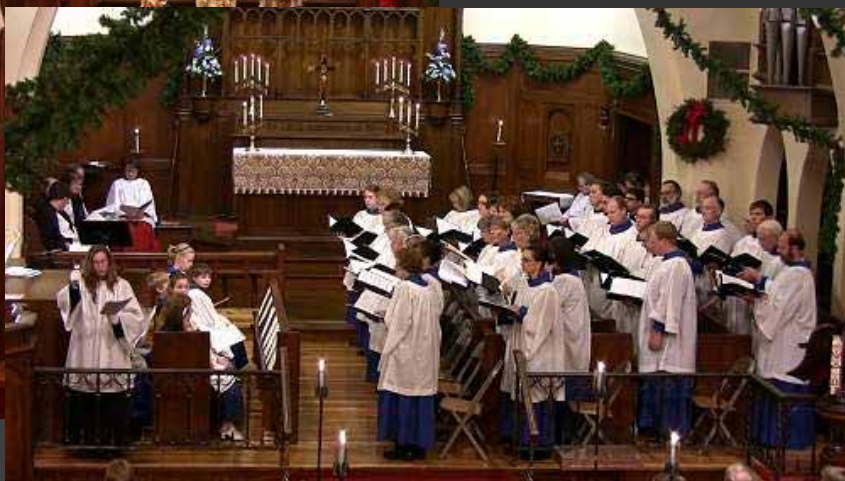
Lessons and Carols