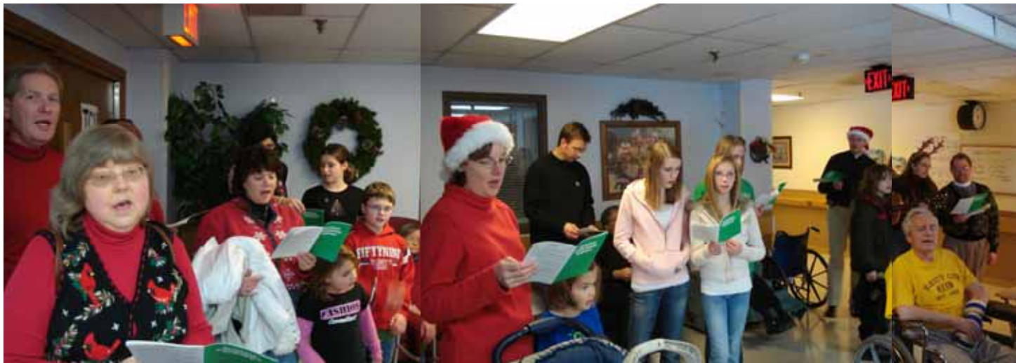
Christmas caroling at the care center