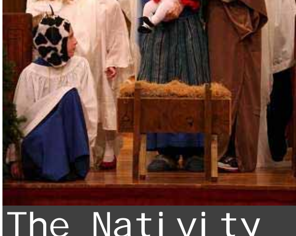
The Nativity Tableau