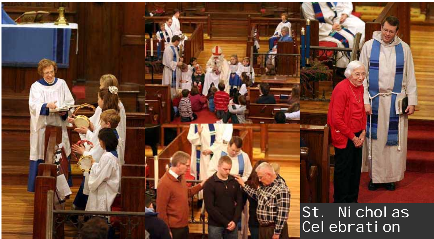
St. Nicholas Celebration