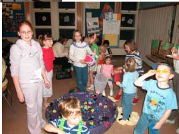
St. John's children go fishing for fun at the Beach Party.